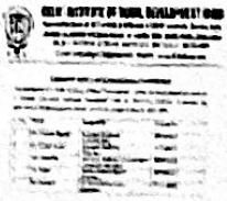
WhatsApp Image 2024-01-03 at 12.50.59 PM.jpeg 137K